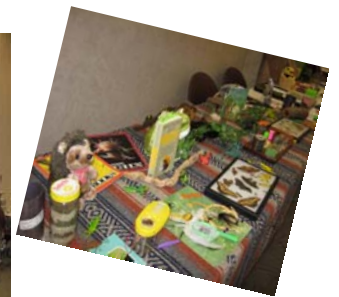
Laura Kaighn of Lady Hawke Storytelling took patrons for a walk on the wild side of their own back yard.