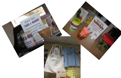
Children, Young Adults and Adults took chances to win some Reading Bug prizes.